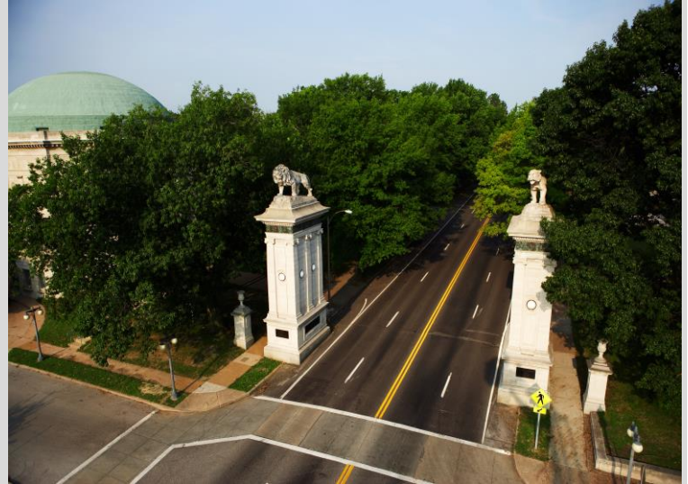
The Lion Gates, found on Delmar Boulevard, were erected in 1901 and marks the western end of the Delmar Loop and the beginning of the residential sections of University City.

University City was able to outsource its IT and upgrade its telephone systems while reducing costs.